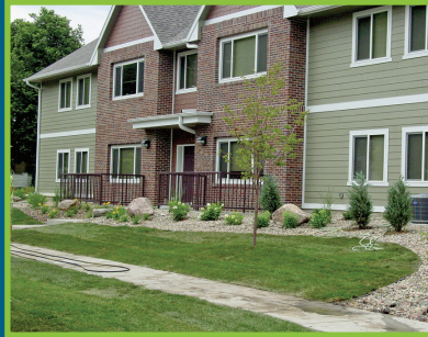
Quad-Multi Family Housing