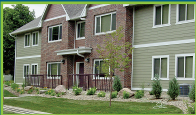
Quad-Multi Family Housing