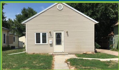
1304 E. 8th Street