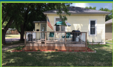
1302 E. 8th Street