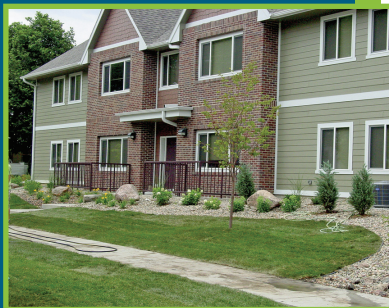
Quad-Multi Family Housing