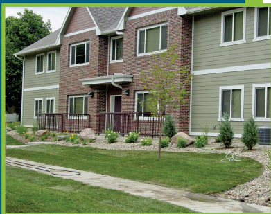
Quad-Multi Family Housing

NON-PROFIT ORGANIZATION U.S. Postage PAID Permit # 7283 Sioux Falls, SD