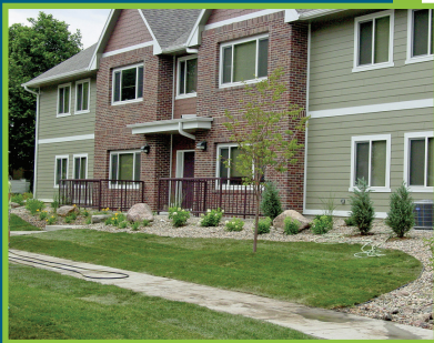
Quad-Multi Family Housing

NON-PROFIT ORGANIZATION U.S. Postage P A I D Permit # 7283 Sioux Falls, SD